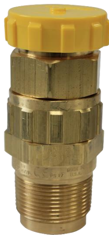
L7579 with 3179B adapter installed.

It is a best practice to use filler hose adapters like the 3179B when conducting any filling operation into a 1-3/4" ACME filler valve. When a filler hose adapter is attached to the hose end valve connection during the filling process and there is a problem disconnecting due to leakage through the upper check, the 3179B or other type filler hose adapters can remain on the subject filler valve. This will allow the delivery person to safely disconnect the hose end valve from the filler hose adapter which will remain connected to the subject filler valve leak free.