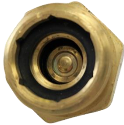
L7579 Showing Upper Check Open